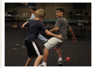
GUY'S OVERNIGHTER 10-15-10