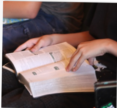
WED. NIGHT SMALL GROUPS 9-15-10