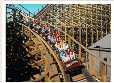
KNOTT'S BERRY FARM 11-13-10