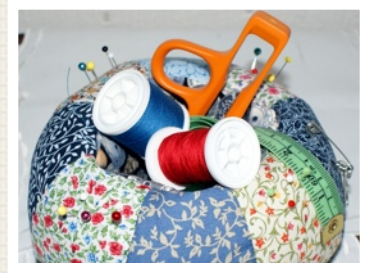
CRUX: CREATIVES CRAFT DAY 10-02-10