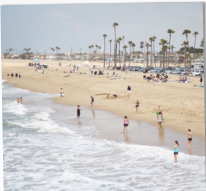
BEACH TRIP 9-18-10