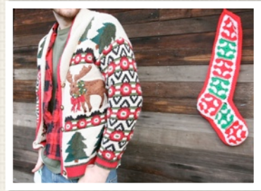
JR. HIGH CHRISTMAS PARTY 12-17-10