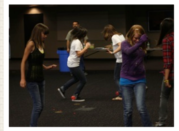
GIRL'S OVERNIGHTER 10-22-10